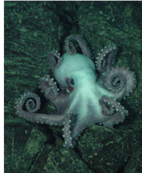
This octopus was spotted on the side of a fault scarp during a geologic traverse by the ROPOS Remotely Operated Vehicles.