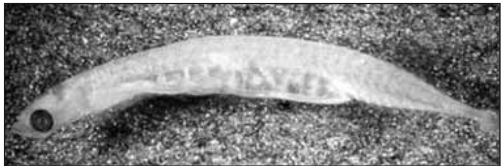
The stout infantfish is no longer than the width of a pencil